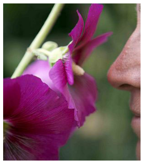
Flowers look good and are a recommended sales tool!

All agree that pleasant smells can appeal to the instincts of the buyer, and they can be be achieved in a a cost-effective way. Remember, you are selling a home, a feeling and a lifestyle – and not just a property.