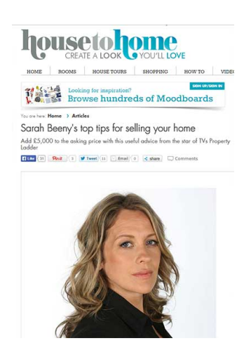
House to Home