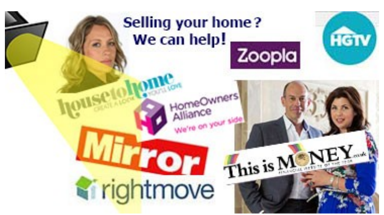
Illustration 1: If you've got nothing to hide, light it up!