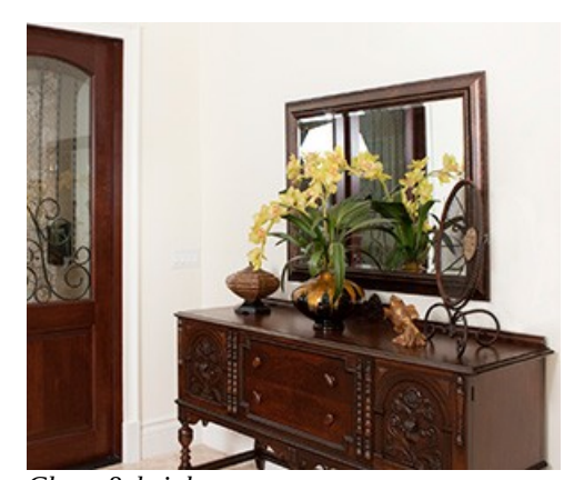
Clean & bright entrance

Cleaning and decluttering are a vital part of getting the sales process going – bear in mind that you are selling a home, not just a house. This means making making it easy for buyers to imagine living an attractive lifestyle in their new home.