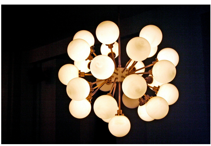
Artificial light helps you out if the real thing's in short supply ...

HomeOwnersAlliance advocates "lamps on in any dark corners" and "a soft lamp in the bathroom can create a warm glow"; Rightmove says that "the wrong lighting can make your home feel dark and drab so install brighter modern lights to