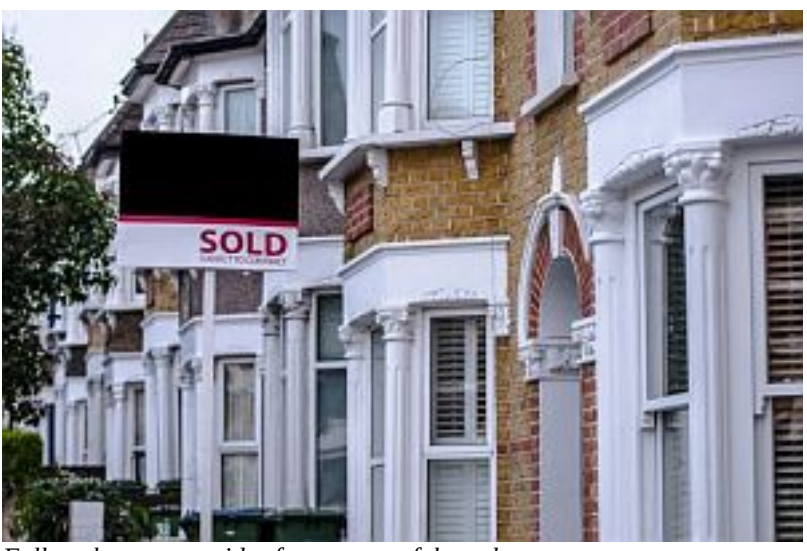
Follow the expert guides for a successful result

When you sell your home, you will also probably need to buy another – unless you don't mind renting for a while. If you move around a lot, owning a home can definitely tie you down and renting is a much more flexible way to live.