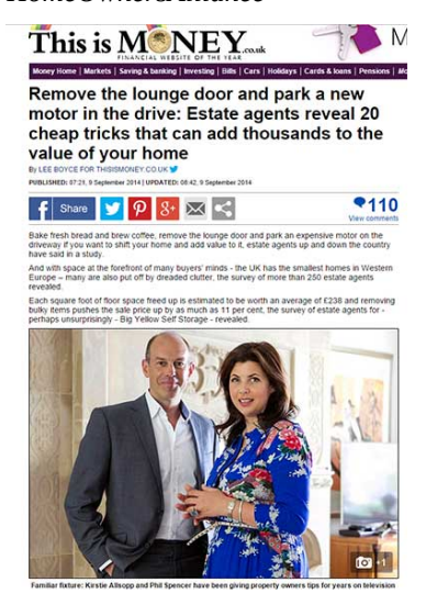
The Daily Mail's This is Money