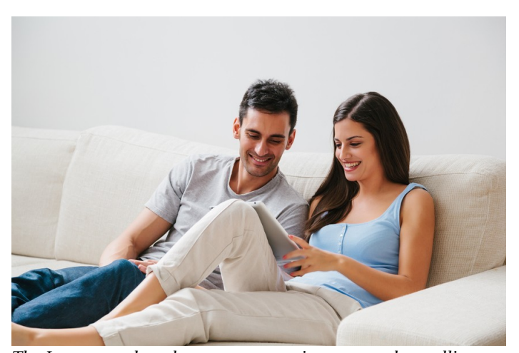
The Internet makes photos even more important when selling your home