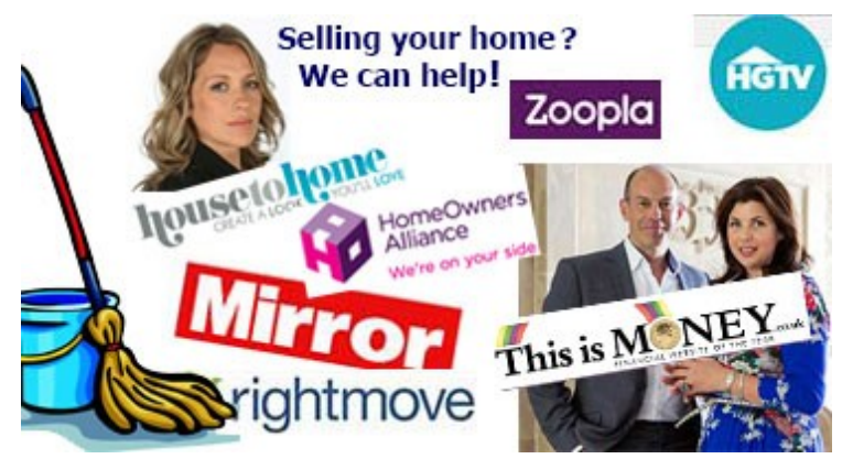
Selling your home? They all agree about decluttering