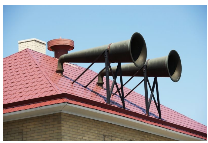
Install an integrated sound system?

Suffice to say, if you knock down your interior walls, convert your attic, build a conservatory and dig out a