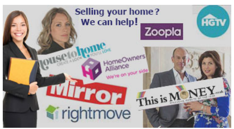
Time for the professionals – estate agents and solicitors