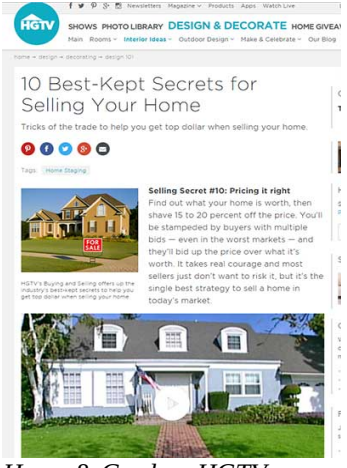
Home & Garden: HGTV