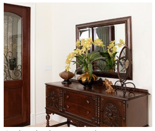
A mirror by the entrance is a great investment

Now you've organised and ditched all your rubbish, given everything a good clean, freshened up the paintwork and increased the amount of light falling on it all, why not make the whole property look bigger using mirrors?