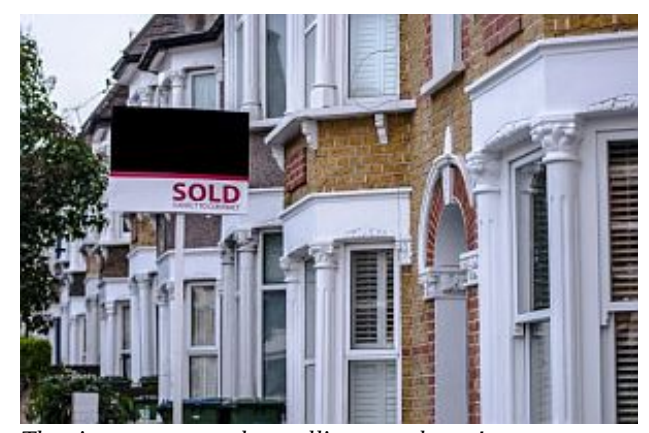
The sign you want when selling your home!

First, there are the traditional estate agents you see on the high street – they suggest a price , take the photos , put your property in their shop window and on their website , list your home on Rightmove , Zoopla and other key websites, organise viewings , and then – you hope – help move the process toward a sale at a price that suits you. Usually the agent will charge an agreed percentage of the price they achieve.