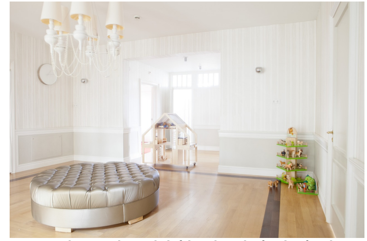
Property photographs are helpful to show the family after the viewing

With many estate agents spending no more than an hour with a camera at each property on their books, it can be worth taking a