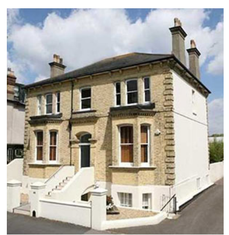
No cars, sunshine ... a perfect setting

A sunny day with no parked cars is definitely worth waiting for!