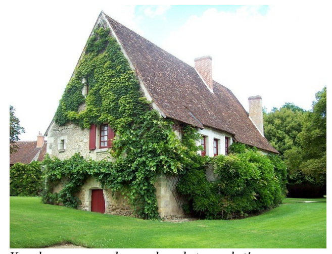
Your home: spruced up and ready to market!