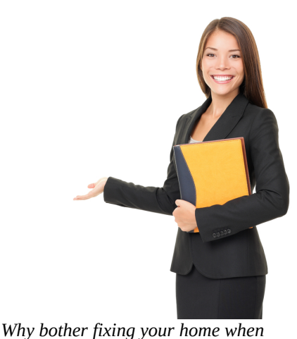
why bother fixing your home when pretty estate agent will do the job?