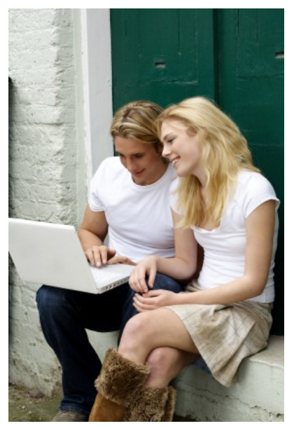
Buying your home: the modern way

A beautiful A BEAUTIFUL cottage or COTTAGE nestling in the Downs THE DOWNS