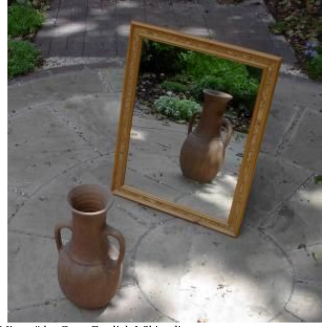
"Mirror" by Cgs - English Wikipedia

At the end of these brightening tips, you will have light streaming in through clean windows into your airy home, glinting off gleaming mirrors and any dark spaces lit up with lamps that show that your home has nothing to hide.