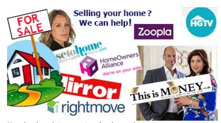
Your hard work is over: time for the market!