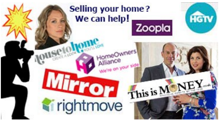
Why is there no advice on photography in their property guides?