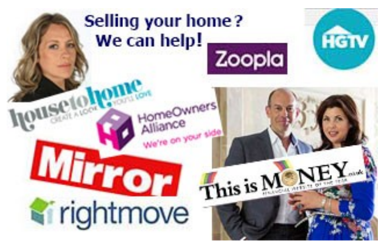
Selling your home – whose advice do you trust?